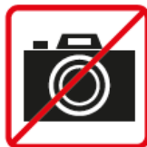
Foto- und Videokameras für gewerbliche Zwecke cameras and video cameras for commercial purposes